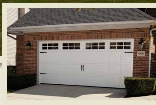
2460 in white with 6-pane windows, hinges and handles