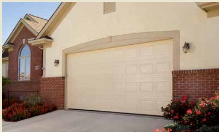
2480 in almond

The 2400 Series carries a Limited Lifetime Warranty as well as a full range of options including glazing, pre-finished color, and window style. Also available is an upgrade to energy efficient insulation with the 2410L, 2460L, 2461L, 2470L and 2480L models. Adding beauty and value to your home has never been so easy!