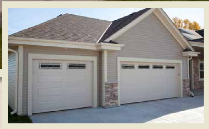
2470 in sahara tan with prairie windows