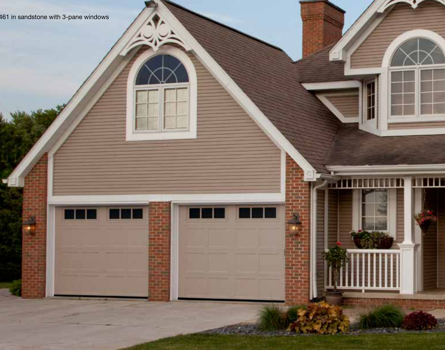
2461 in sandstone with 3-pane windows