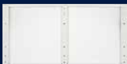
Insulated Laminate Back (L) - inside view